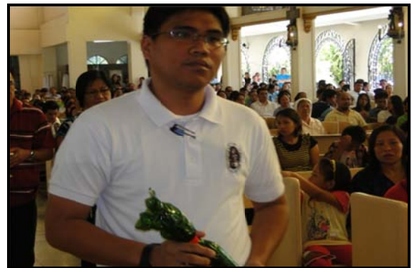
The IBP-Cotabato Chapter sponsors a Holy Eucharistic Celebration