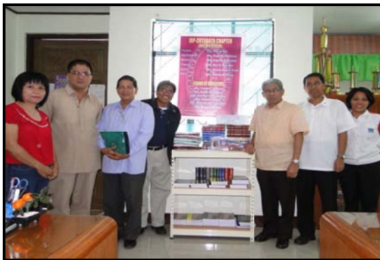
IBP-Cotabato Chapter launches its BookShop and Souvenir items.(5/9/11)