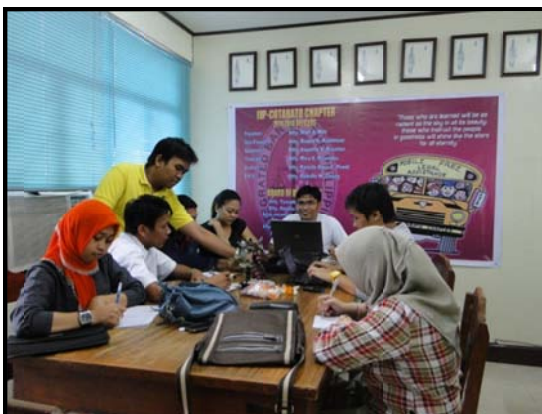
(A half-day seminar-workshop conducted by the IBP-Cotabato Chapter, on preparations of basic legal documents/instruments to the NDU-College of Law Students, who are IBP Cotabato Chapter volunteers, on 19 April 2011, at IBP Office, Hall of Justice Bldg., ORG-ARMM Complex, Cotabato City)

The IBP-Cotabato Chapter , under the sound principle of coordination and collaboration, shares its programs, more particularly its MFLAP, with NGOs and POs operating in the City of Cotabato as well as in the Province of Maguindanao, under great belief that if all acts of goodness are concertedly delivered the magnitude of benefits is certainly obtainable by the people. Also in this program that the Chapter acts as convenor with the same NGOs and POs with the end in view of strengthening partnerships so that delivery of services becomes productive in an exponential way. Notably, the Chapter extends whole support to the religious institutions that which includes Prison Ministry as part of their pastoral works.