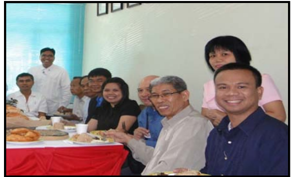
(Fellowship and/or Fraternal Breakfast at IBP Office, Hall of Justice Bldg., ORG-ARMM Complex, Cotabato City, hosted by the New Set of Officers )