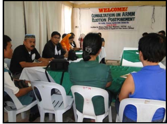
The IBP Cotabato Chapter participates in consultative meeting/forum on the postponement of ARMM-2011 Election. It maintains its position on the rule of the law. (10 June 2011, afternoon, Estosan Garden Hotel, Cot. City)