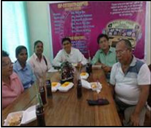
Meeting with the Religious Sisters of Missionary of Christ Jesus and their lay Volunteers, to whom the IBP President made the Chapter's whole-hearted support to their Prison Ministry as part of their pastoral works. (10 June 2011)